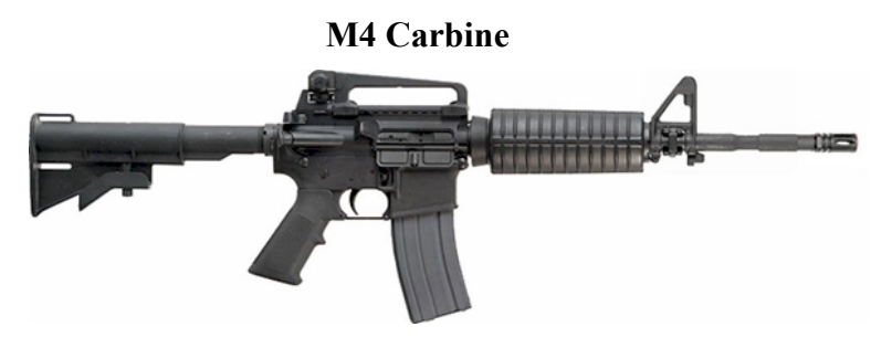
The first version of the M4 carbine with a four-position collapsible stock

The M4 is the carbine version of the M16, with a collapsible stock and shorter length (usually a 14-inch barrel), but still chambered for the 5.56. It's an evolution of the Colt Automatic Rifle-15 Military Weapons System, better known as the CAR-15, which was made by Colt in the late 1960s and early 1970s and was used by some units in Vietnam. Afterward, it was issued as the Colt Commando for applications that required more mobility and compactness, but better range and a harder-hitting round than the pistol-caliber MP5 submachine gun or the aging M3 "Grease Gun".